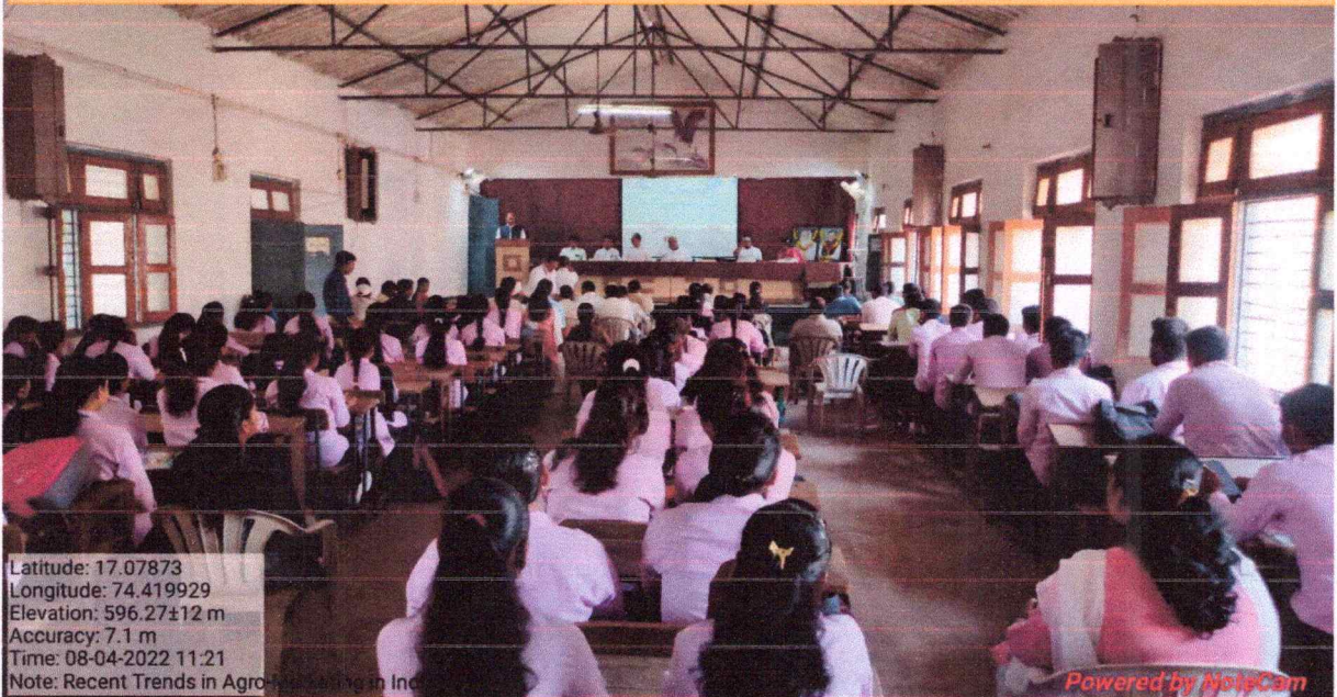
Audience in the programme- Recent Trends in Agro Marketing in India dated on